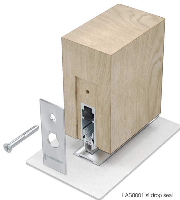
LAS8001 si drop seal (shown with LAS4002 threshold plate)